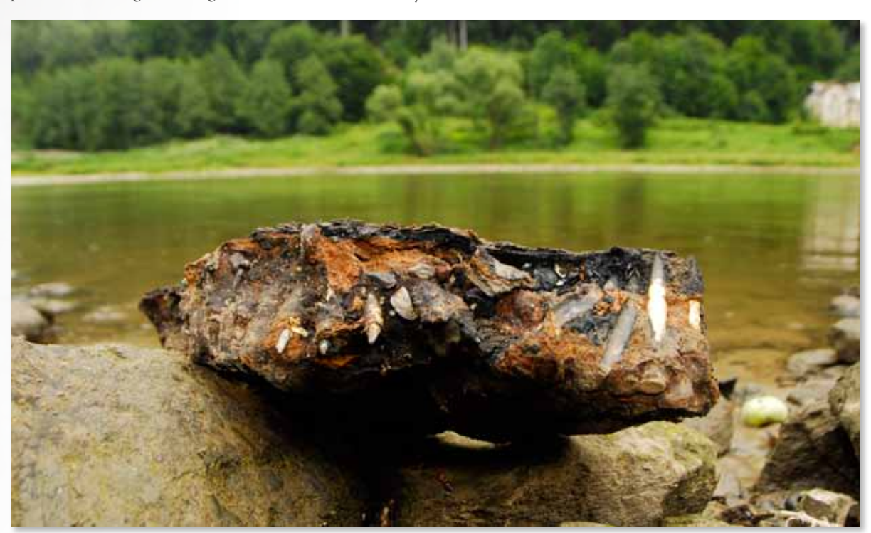
/ The case for machine gun bullets during the search for a tank from World War II

In the journalistic magazine programme "Rentgen" ("X-Ray"), Radio Wave reminded listeners of the 35<sup>th</sup> anniversary of the completion of one the most notable buildings in Prague from the 1970s – the Máj department store. May also saw an important historical landmark as Czech Radio marked the 65<sup>th</sup> anniversary of the Prague Uprising. Programme-makers were interested to discover precisely how the most important mass medium at the time, namely Czech Radio, informed listeners during the final days of the Nazi Protectorate of Bohemia and Moravia. ///