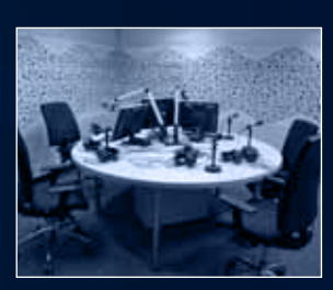
200 0 18 May

The occupation of Czechoslovak Radio buildings, fighting outside the Czechoslovak Radio building in Prague (15 dead)