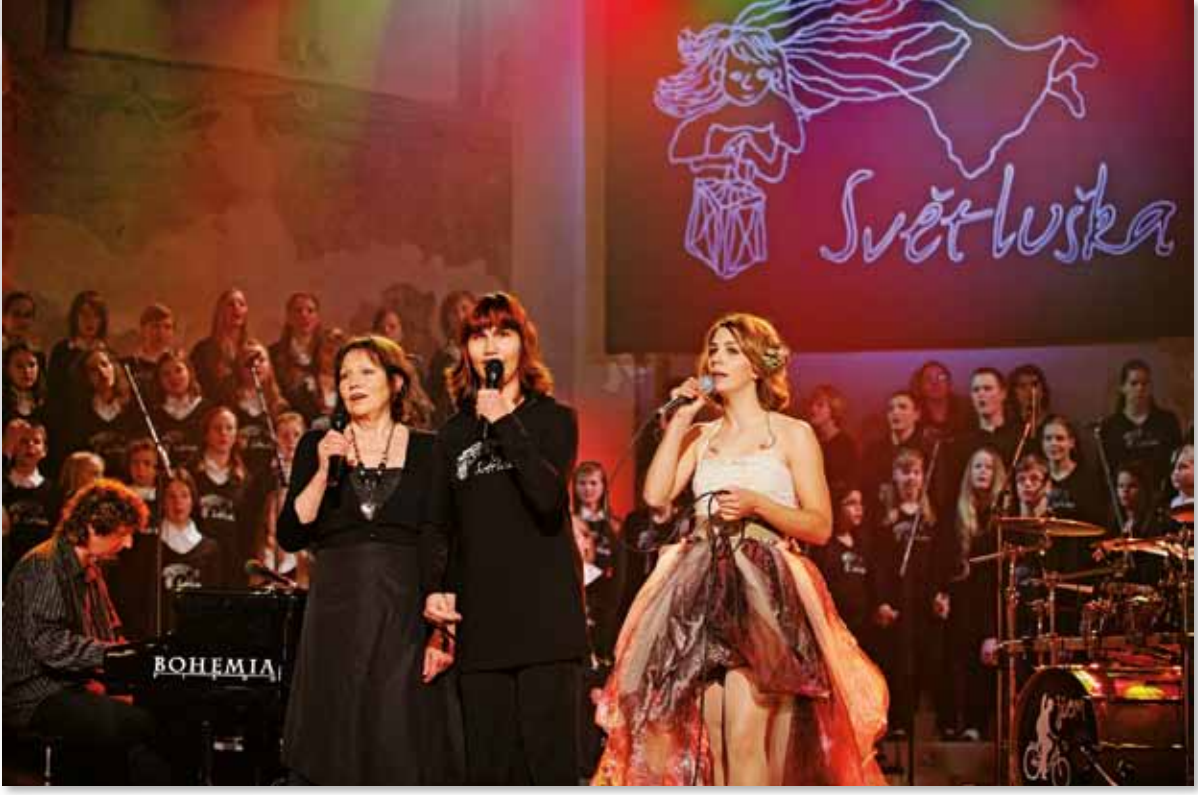
/ Benefit concert Light for the Lightning Fly, November 2010