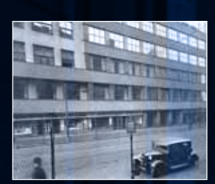
1933 10 December

Ceremonial opening of the new Czechoslovak Radio building in Vinohradská Street 12, Prague 2