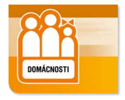
Households pay 45 CZK per month for the possession of one radio receiver.

be made to seek out inexpensive, fast and reliable channels for communicating with licence fee payers